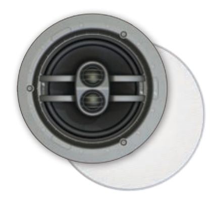
Packaged Individually with Round MicroThin<sup>™</sup> Grille Stock Number