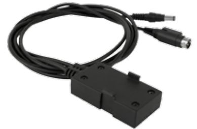
Above: PSU-RPS-5V. 12V to 5V converter power adaptor

VSC48: 2m 3-pin locking to 3-pin locking power lead PSU-RPS-5V: 12V to 5V converter power adaptor. 2 meter PSU-RPS-5V-5M: 12V to 5V converter power adaptor. 5 meter RMK4D-R2: Rack mount bracket with holder for power adaptor (PSU-RPS-5V) PSU-RED-460W: Additional 460W power module