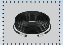
All necessary cables