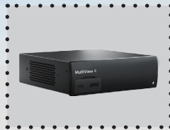
4 Channel Multi-viewer