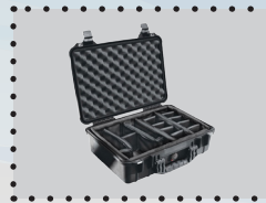
Foam Set Included