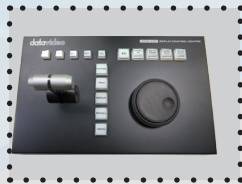
Instant Replay Control