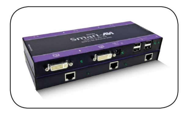
Dual DVI-D and USB 1.1 Extender up to 275 feet over STP Cable