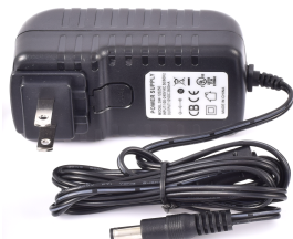
DC12v Power supply

AIDA Imaging manufactures advanced imaging and streaming devices for several different industries and applications. Our focus is on providing innovative products, maintaining quality control, and excellence in service to professionals and consumers worldwide. All AIDA Imaging devices are proudly designed in the USA.