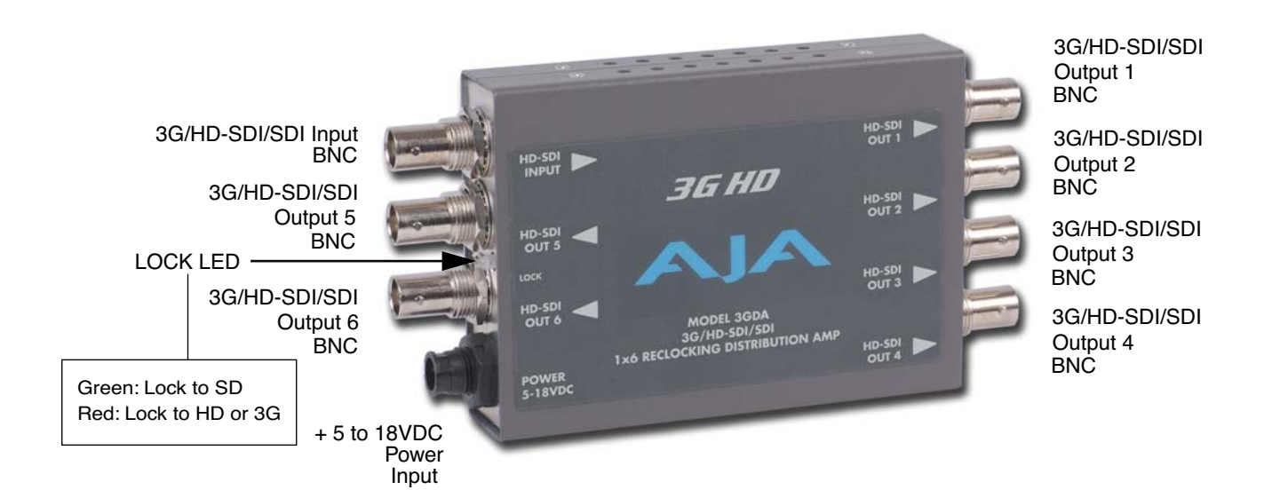
3GDA, Side View