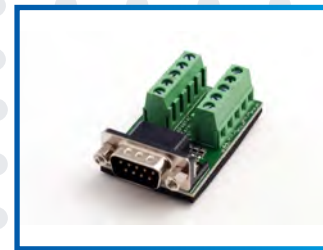
DB9 GPI Breakout