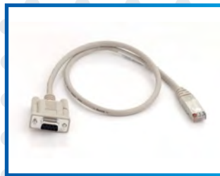
RJ45-DB9: RS232 Adapter