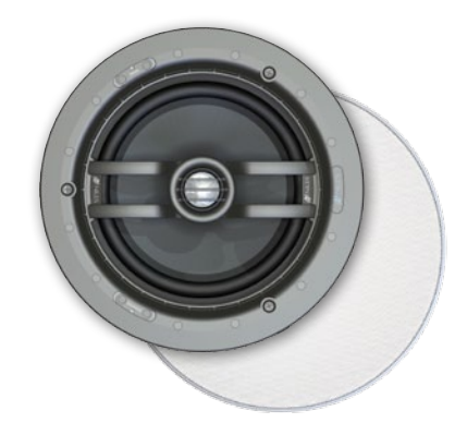
Packaged Individually with Round MicroThin<sup>™</sup> Grille

For advanced home theaters and primary listening rooms