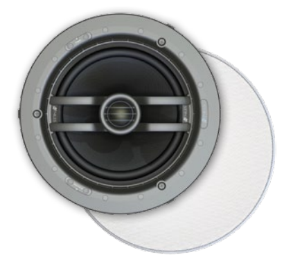
Packaged Individually with Round MicroThin™ Grille

For advanced home theaters and primary listening rooms