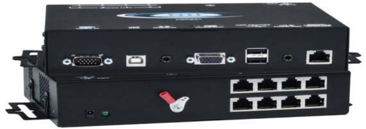
VOPEX-C5USBVA-8 Local Unit (Front & Back)

The VOPEX® VGA USB KVM Splitter/Extender allows up to eight remote users (8 USB keyboards, mice, and VGA monitors) to access one USB computer (PC, SUN, MAC) located up to 1,000 feet away using CAT5/5e/6 cable. Audio can be broadcasted to self-powered stereo speakers at the local unit and each remote location.