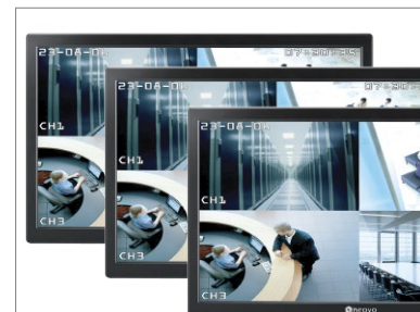
Looping BNC video inputs allow multiple display connections