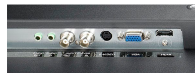
Video versatility, including VGA, HDMI, S-Video and BNC In/Out