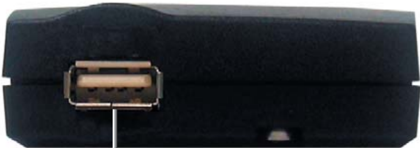
1 port USB Hub connects to USB devices