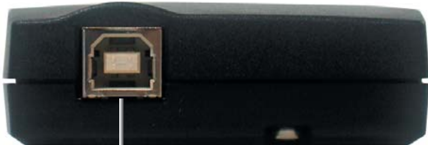
USB In from computer