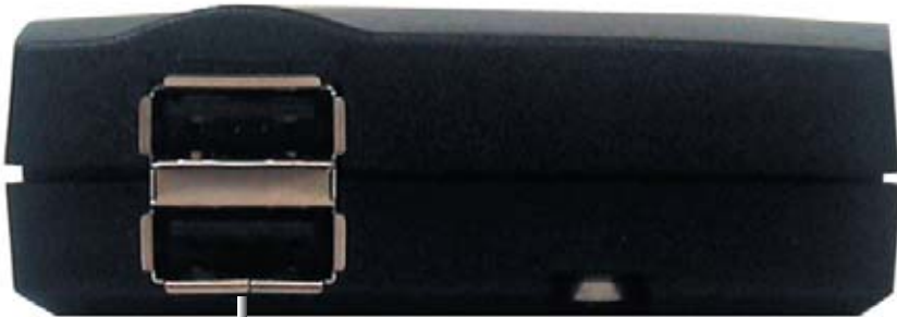
2 port USB Hub connects to USB devices