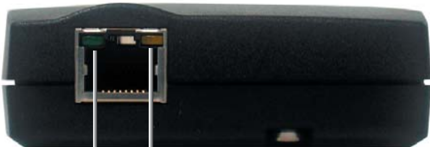
Device LED (green) Link LED (yellow)