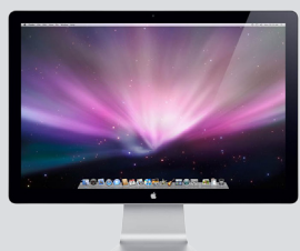
Mac 24" or 27" Monitor