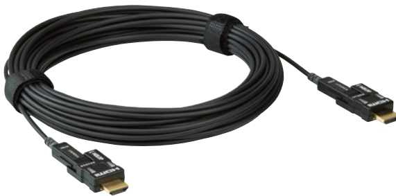
VE7832 / VE7833