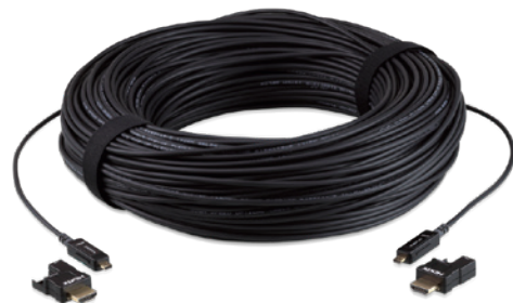
VE7834 / VE7835