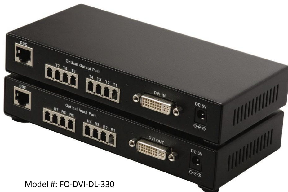
Model #: FO-DVI-DL-330