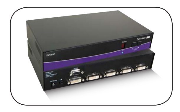
Display Content From 4 Computers, PC or Mac on one Display Up To 20 Feet Away

4-Port Cross-platform DVI-D with RS-232 and IR Control